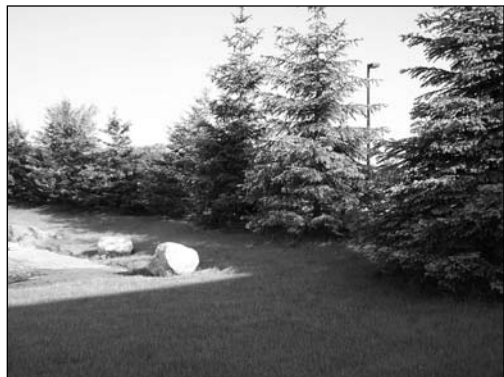
Too much water or mites

Yellowing: Too much water or mites can cause trees to look off-color. This is a common sight to see and telltale signs when trees are stressed. Arborists must check closer to see whether water or mites are the problem. Solution = adjust sprinklers (if possible), raise up the area they are planted (if tree is small enough), spray for mites (if necessary) and definitely give the tree a Bio-stimulant for immediate boost needed as the tree is stressed and will be vulnerable to attack.