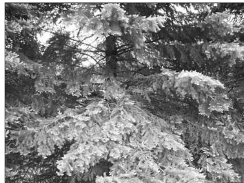
Needlecast...a fungal disease